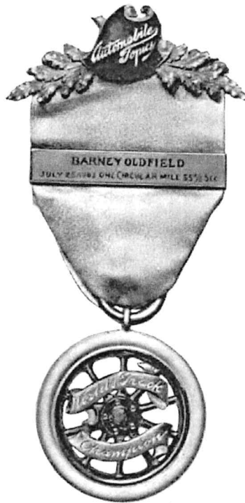
THE TRACK CHAMPIONSHIP BADGE Presented by Automobile Topics